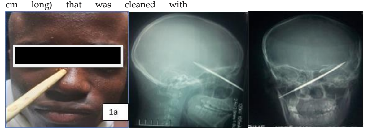
1a1b1cFigure 1: Picture showing arrow insitu (1a), Skull X-ray lateral view (1b), and AP view (1c) showing arrow passing<br/>through the nasal cavity and left orbit into the cranial cavity.

Chlorhexidine gluconate, methylated spirit, and covered with povidone-iodine-soaked gauze. Left temporal craniotomy was done, dura opened, followed by corticectomy. Under direct vision, the arrow was held (as in figure 3a) firmly and via a gentle, progressive ante grade pull, with minimal rotatory movements, it was successfully extracted out at the temporal end as shown in figure 3b. No significant bleeding, craniotomy closed in layers, and surgical wound cleaned and dressed. The Arrow tract was irrigated with dilute Hydrogen Peroxide (H2O2) from the facial wound. The nasal wound was explored, closed debrided, and by the otorhinolaryngologist while the ophthalmologist re-assessed the eye on the table. Postoperatively, antibiotics (intravenous ceftriaxone and metronidazole then oral amoxicillin/clavulanic acid and metronidazole) were continued for 14 days, had prophylactic anticonvulsant (parenteral phenobarbitone then carbamazepine) for 7 days. No post-operative seizure, neurological deficit, visual disturbance, epistaxis, or CSF leakage. Wound stitches were removed on day 10 (figure 3c), and he was discharged home. He was followed up thrice over a 6 uneventful month period.